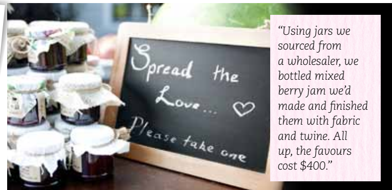
"Using jars we sourced from a wholesaler, we bottled mixed berry jam we'd made and finished them with fabric and twine. All up, the favours cost $400."