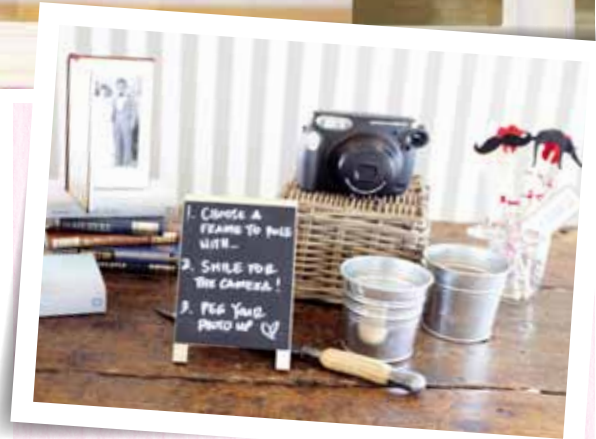
"We created our own photobooth set up with a polaroid camera, funny props presented in a jar and a blackboard with instructions. Guests then pegged their pictures up on a display made from a large frame and rope."