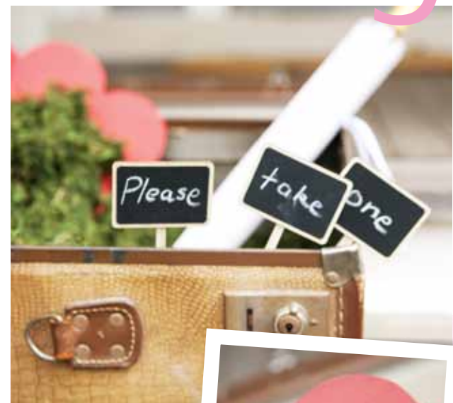
"We made our heart-shaped fan programs out of thick red card, paddle-pop sticks and glue tape for $35. We displayed them in a $15 suitcase I found at Sydney's Rozelle Markets."