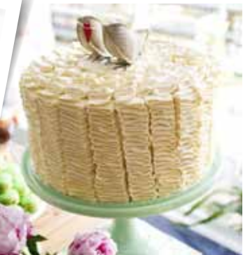
"Two little birds sat on top of our raspberry and white chocolate cake, which had soft ruffled icing and was by Sweet Bloom Cakes. Toppers were from Cotton Bird Designs at Etsy for $90."